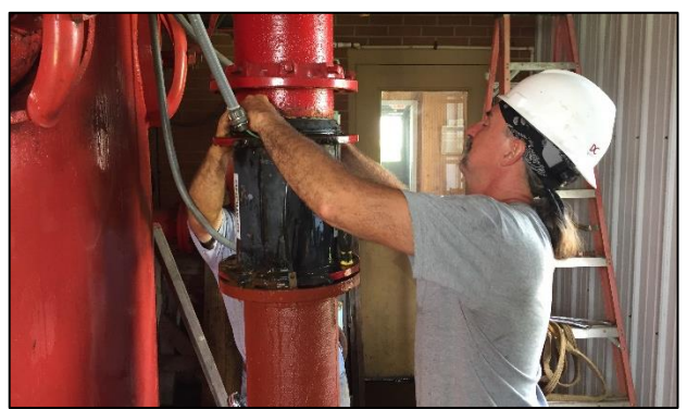
Doll-Layman, Ltd. is the project contractor. Doll-Layman workers are shown here making improvements to water lines inside the plant.

In advance, thank you for your patience during this important project.