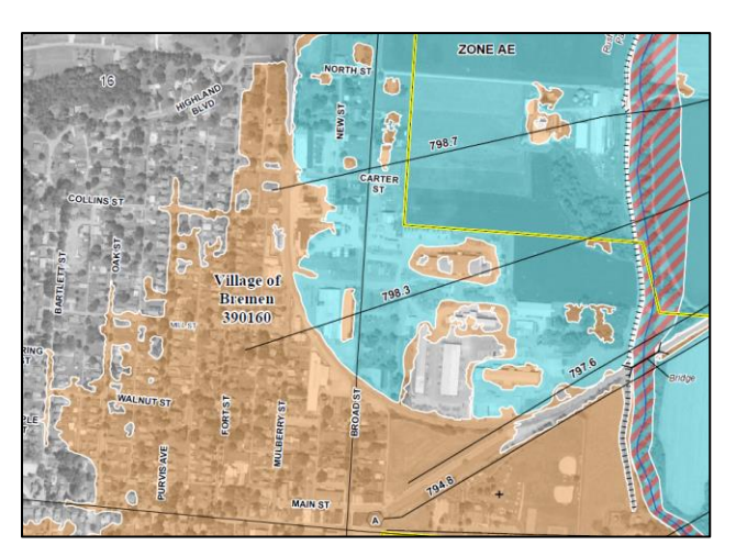
Portion of the proposed revised Flood Insurance Rate Map showing part of the Village of Bremen. Blue-shaded areas denote the 100-year flood hazard zone where property owners would be required to purchase flood insurance. (Note: color shading is absent on the black-and-white newsletter version)

Questions or comments about the proposed map revisions may be directed to James Mako of the Fairfield County Regional Planning Commission, 210 East Main Street, Room 302, Lancaster 43130. Phone: 740-652-7110.