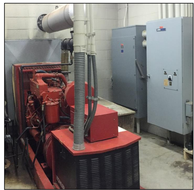
Diesel generator and electrical panel damaged by the storm.

We are now evaluating alternatives for replacing and/or repairing the damaged plant equipment. It is expected to run into the tens of thousands of dollars.