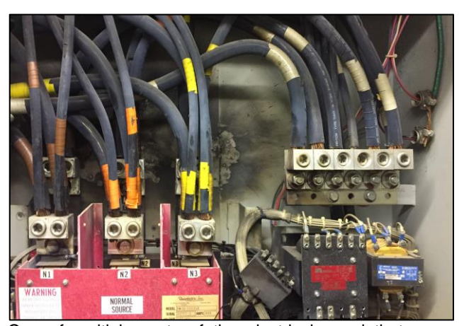
One of multiple parts of the electrical panel that were burned out by the electrical surge.