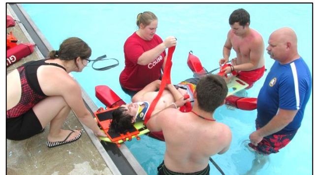
Lifeguards practicing water rescues with members of the Bremen-Rushcreek Fire Department.