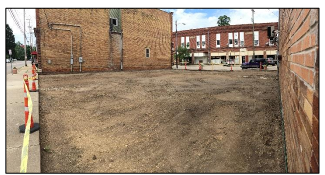
Views of the site cleared and ready for the next project phases.