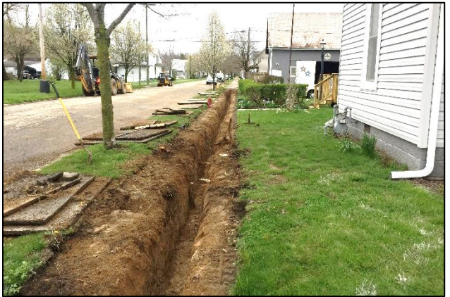
Trench excavated along the east side of Oak Street for installation of a new Columbia Gas main line. A new concrete sidewalk will be provided.

Columbia Gas invites everyone to attend an openhouse style public meeting on Wednesday , May 2 , at 6:00 p.m. , at the Bremen Area Historical Society, 161 Carter Street. Details about the project scope, schedule and impacts will provided.