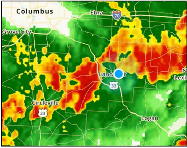
The weather radar map showing bands of heavy rain going through the region in early April.

Another round of heavy rain came on April 14-15, with 4.5 inches captured in the rain gauge. Again, the storm and sanitary sewers were backed up, especially in the west half of town.